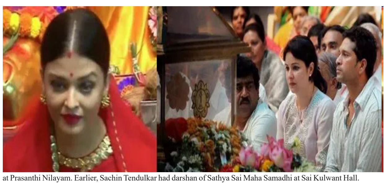
at Prasanthi Nilayam. Earlier, Sachin Tendulkar had darshan of Sathya Sai Maha Samadhi at Sai Kulwant Hall.

Puttaparthi, November 18: Famous film actress Aishwarya Rai and Indian cricket legend Sachin Tendulkar visited Puttaparthi in Sri Sathya Sai district. They attended the centenary celebrations of Sathya Sai. Film actress Aishwarya Rai visited Baba Maha Samadhi at Sai Kulwant Hall. Meanwhile, former Indian cricketer Sachin Tendulkar also reached Puttaparthi to attend the Sathya Sai centenary celebrations. On this occasion, Minister Nara Lokesh had a special meeting with Sachin Tendulkar