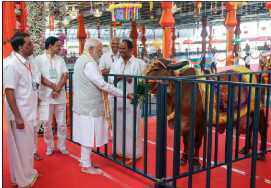
Prime Minister Narendra Modi feeds cow during the birth centenary celebrations of Sathya Sai Baba, in Puttaparthi